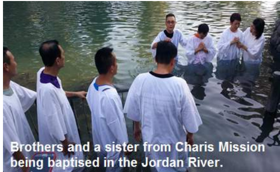
Brothers and a sister from Charis Mission being baptised in the Jordan River.

name of the baptismal site) early and were able to enjoy a great devotion moment amidst the beauty and serenity of the place without encountering much noise and disturbances around us. As 1 sister and 7 brothers in our group – trainers and theological students from Charis Mission (a Christian